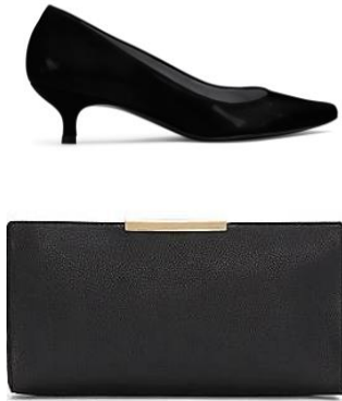
Black dress pump and matching portfolio