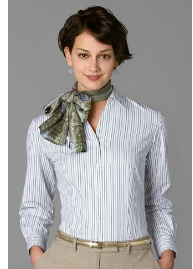
Striped shirt with scarf