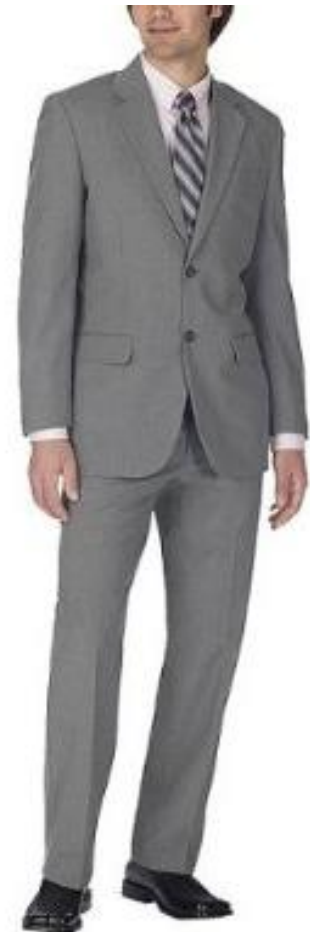
MODEL # 3