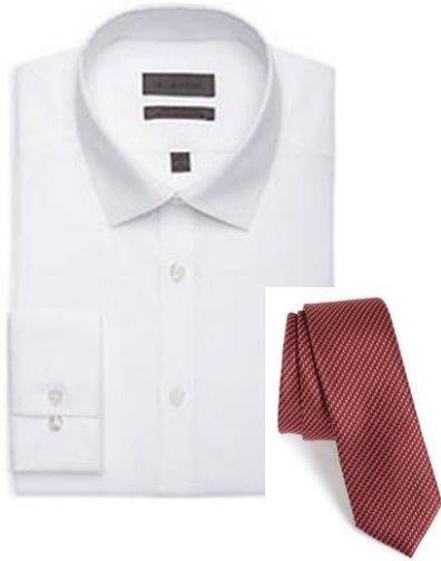
Solid white cotton shirt and red geometric tie