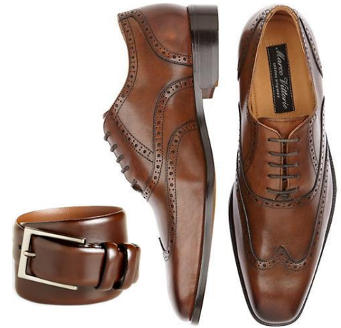
Brown leather lace-up, wing tip shoe and matching belt