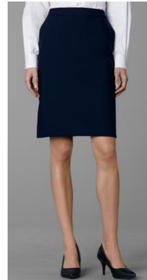
Skirt hemmed to the knee