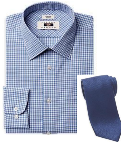
Blue check shirt and solid blue tie