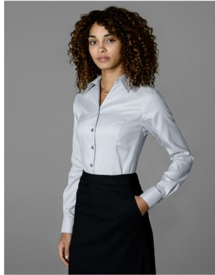
Collared grey cotton blouse