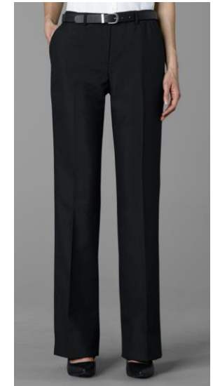
Pants with little or no break at the hem