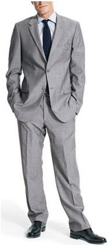
MODEL # 1